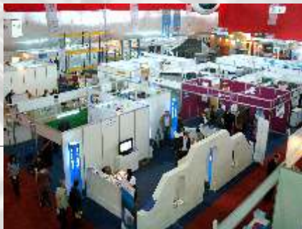
View from the EXPOKOS Fair 2009