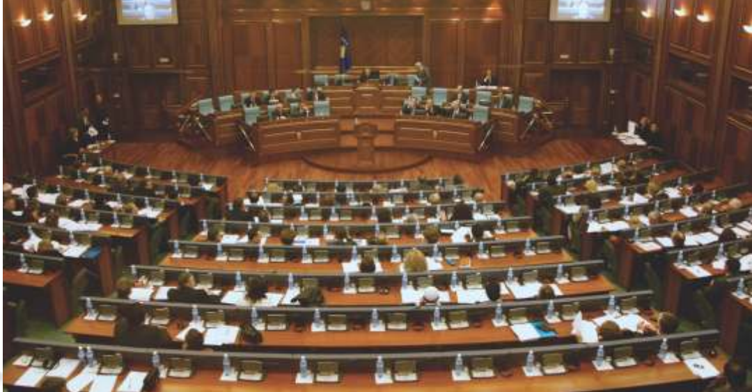
Parliament of Kosovo